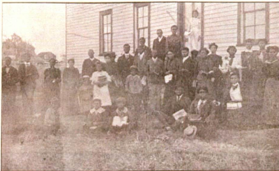
FACULTY AND STUDENTS.